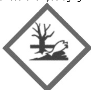
AQUATIC ENVIRONMENT HAZARD